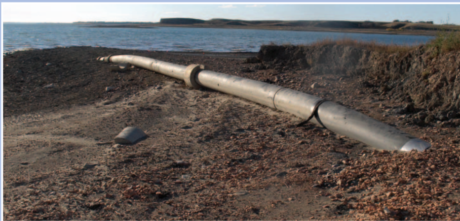
This photo shows the old 24-inch intake pipe that was installed in 1992. The pipe was covered with dirt last fall but because of wave action and declining lake levels, the pipeline was once again exposed.

Lake Sakakawea drops, more line is exposed, increasing the likelihood of freeze-up problems as colder weather approaches. In response, the Water Commission approved a grant in the amount of $106,351 at its Oct. 12 meeting in Bismarck to assist with a project to alleviate the problem.