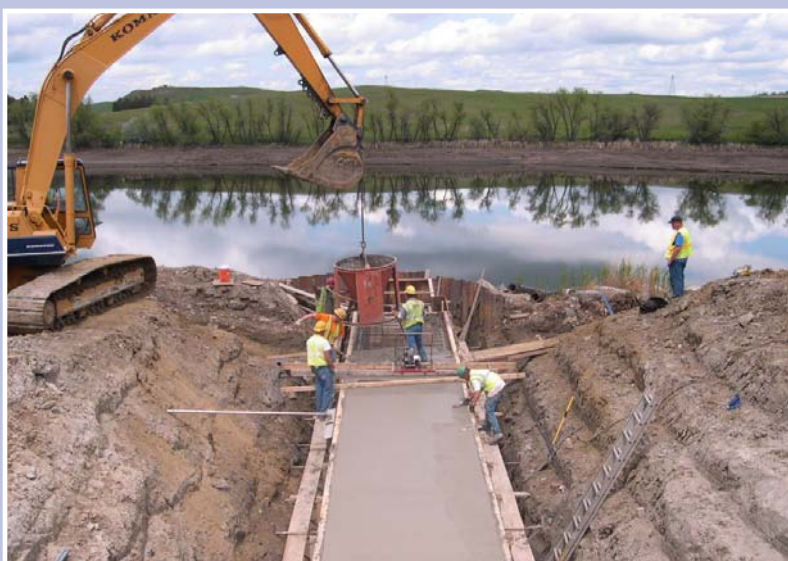
Pouring concrete for the new drop inlet at Crown Butte Dam.

In addition to providing a financial contribution to the repairs on the dam structure, the Game and Fish Department is also completing modifications to the reservoir to improve habitat and provide better opportunities for shore fishing.