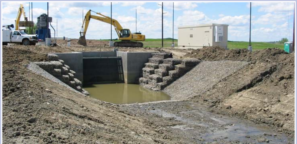
Outlet construction work continues near Josephine pump station.

Interested individuals can also submit their ideas, questions, and concerns to the steering committee through the project website at www.nwo.usace.army.mil/html/Lake_Proj/garrison/welcome.html or by contacting the Corps at: U.S. Army Corps of Engineers, ATTN: Steven Rowe, 106 South 15 th Street, Omaha, NE 68102, (402)-221-7673, (888)-835-5971 toll free.