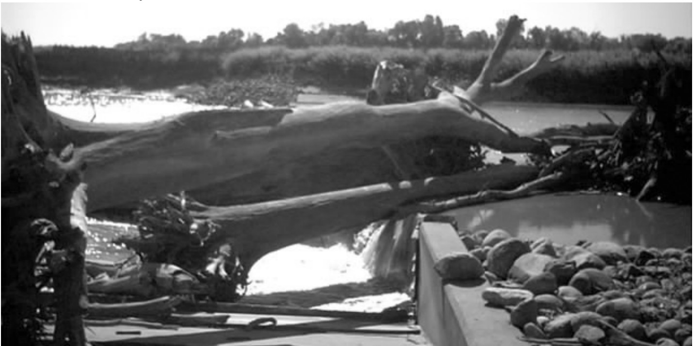
Tree trunk debris at Drayton Dam.

• Stream Bank Stabilization: Several stream bank stabilization projects were completed for the North Dakota Department of Transportation across the state.