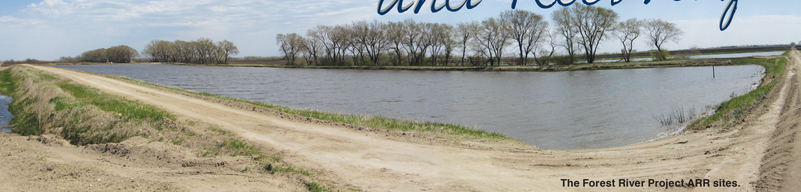
The Forest River Project ARR sites.

Agricultural water, which is primarily used for irrigation, remains the single greatest consumptive water use, by volume, in North Dakota. While irrigation can enhance yields in crop production and allows agriculture in areas that would not receive sufficient precipitation in “normal” years, it can face serious challenges in terms of water availability.