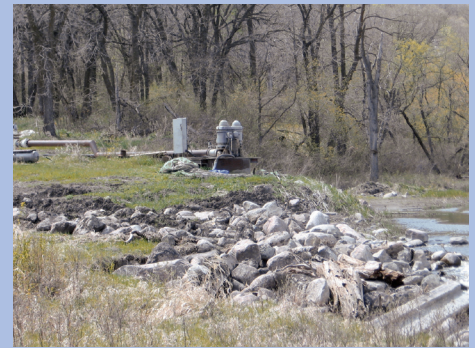
The intake in the Forest River for the ARR.