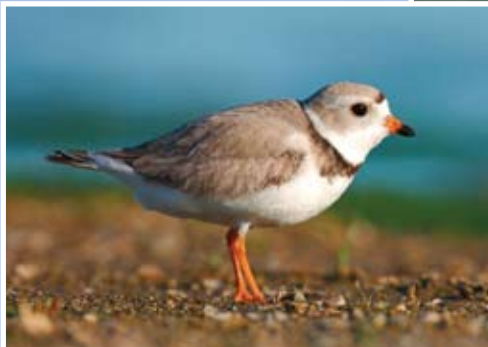
Missouri River riparian development (top), threatened and endangered species (bottom left), and energy production (bottom right) are only a few of the many topics to be covered at the 2010 institute.