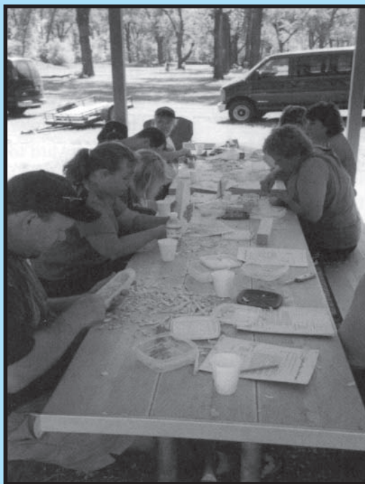
Institute participants are carving dugout canoes while learning about the watercraft used by the Lewis and Clark Expedition.

The institute was taught by Project WET facilitators and was funded in part by an EPA Section 319 Non-point Source Pollution grant, the State Water Commission, local county water resource districts, soil conservation districts, and school districts. ■